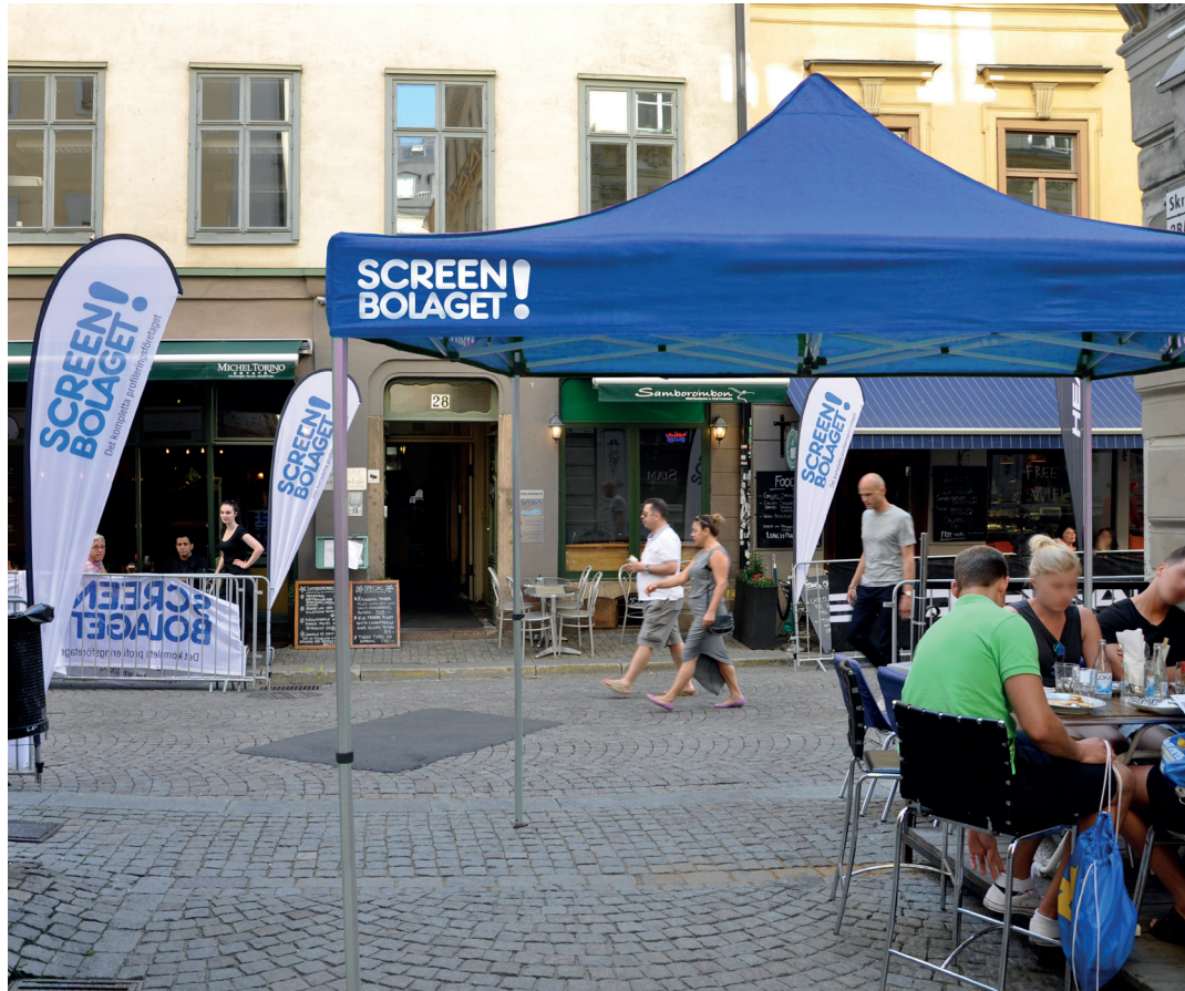
Art no 3717-3, 3717-4,5, 3717-6