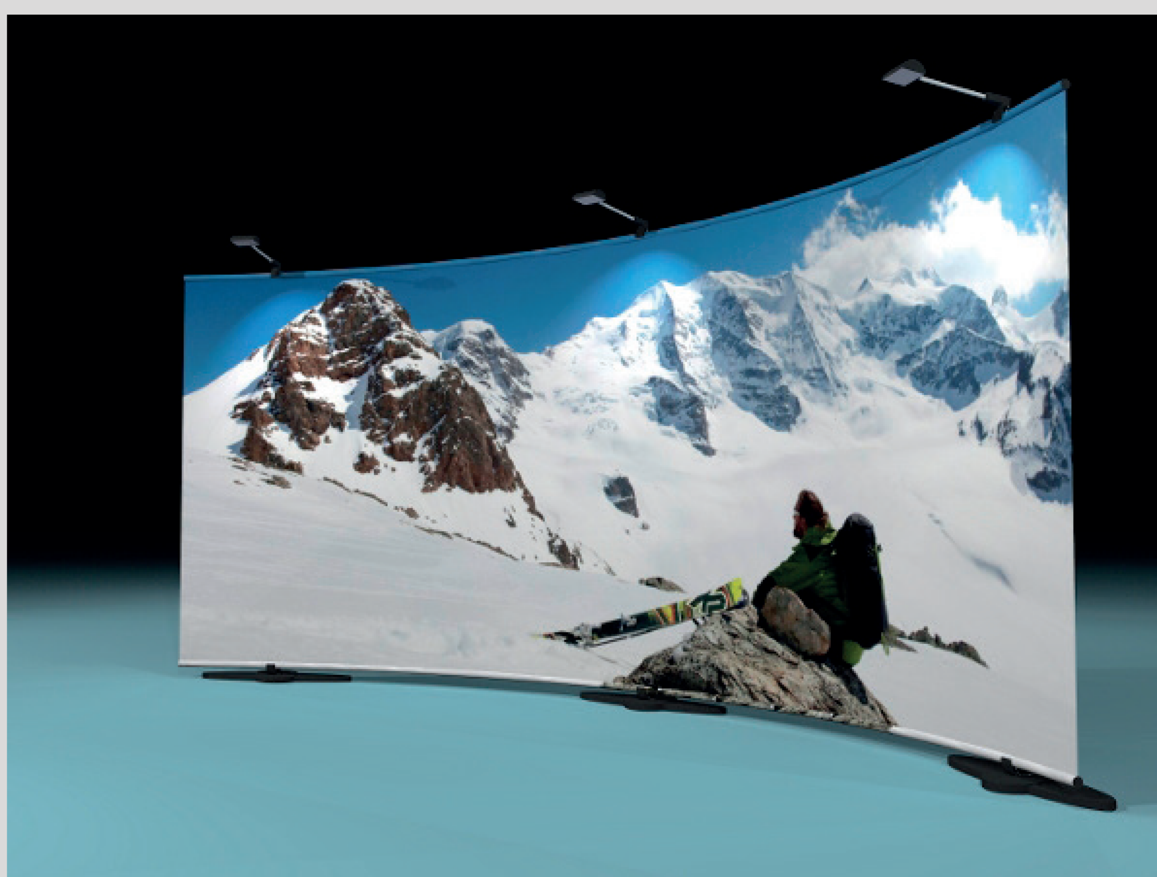
Stage 2,2x3 curved or Straight